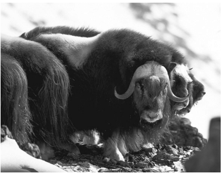
Muskox on the Yukon North Slope.